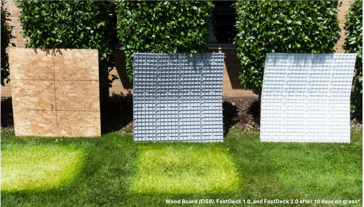
Wood Board (OSB), FastDeck 1.0, and FastDeck 2.0 after 10 days on grass*